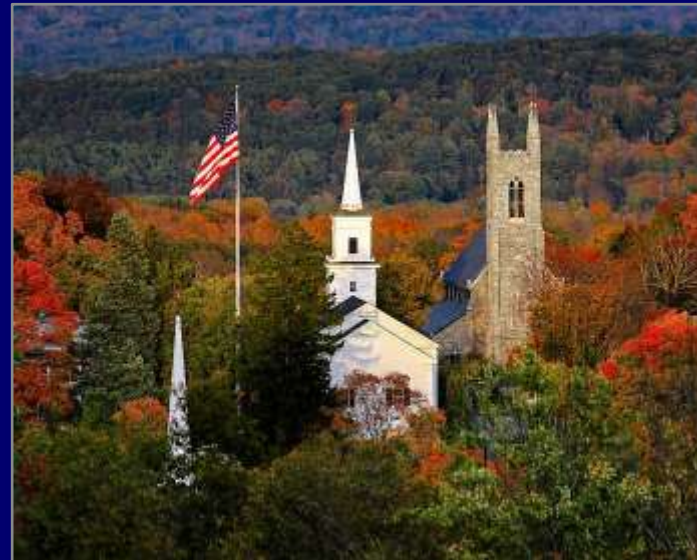
View from Castle Hill, Newtown, CT