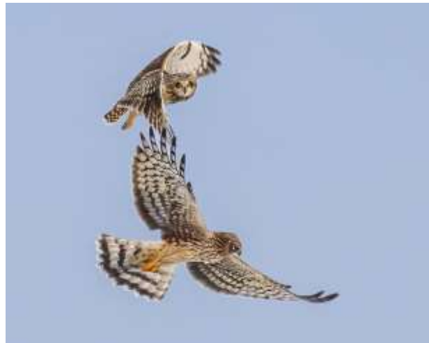
Nature B - First Place "Competing For Food" by Katie Slawitschek Flagpole Photographers Camera Club